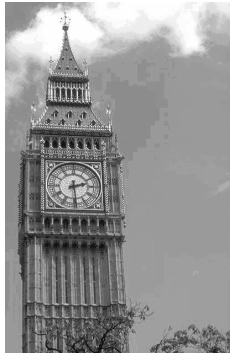
"Big Ben" at the Houses of Parliament – Westminster, London.